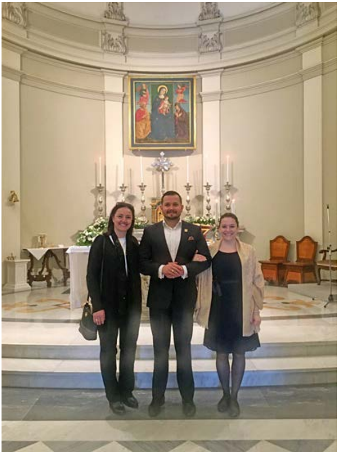
Visit to the Vatican Gardens