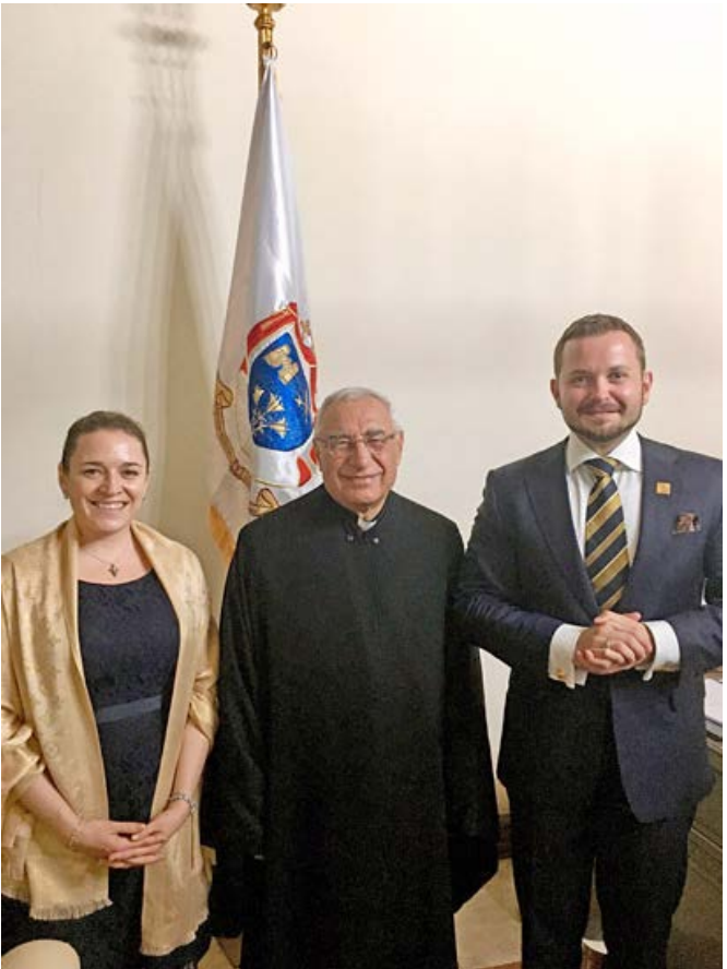
Audience granted by His Beatitude The Most Blessed Joseph Absi, Melkite Greek Catholic Patriarch of Antioch and All the East, Alexandria and of Jerusalem and visit to the Patriarchal Church Cosmedin in Rome.